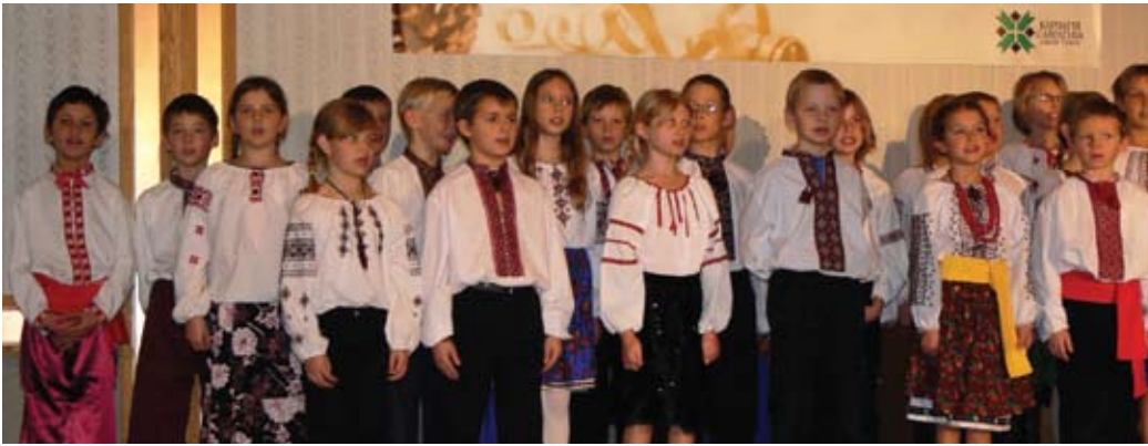
Grade 3 and 4 students from Happy Thoughts School were bussed in from Selkirk to sing traditional Christmas carols. They even performed some lively Ukrainian dances, much to the delight of the crowd!