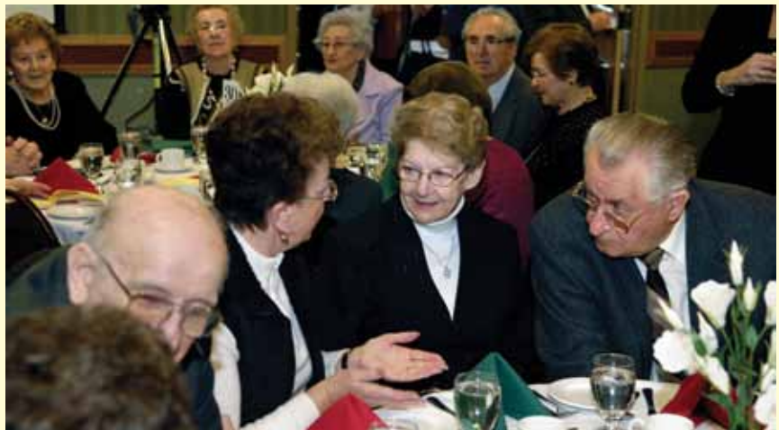
The annual luncheon gives everyone a chance to reconnect and catch up with friends and neighbours.